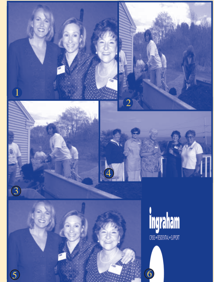
(1) 2005 Annual Meeting (2) Ingraham's new home office building at 50 Monument Square in Portland, Maine (3)Volunteers at the Day of Caring (4) Summer community outreach evening to promote Ingraham's mission (5 & 6) Spring Thing 2005, Ingraham's gala fundraiser

The mission of Ingraham is to assist persons in crisis; to provide people in need with a safe environment, access to services, and the opportunities and means to help themselves; to identify unmet human needs; and to act as a catalyst for the development of new social policies and resources in the state of Maine.