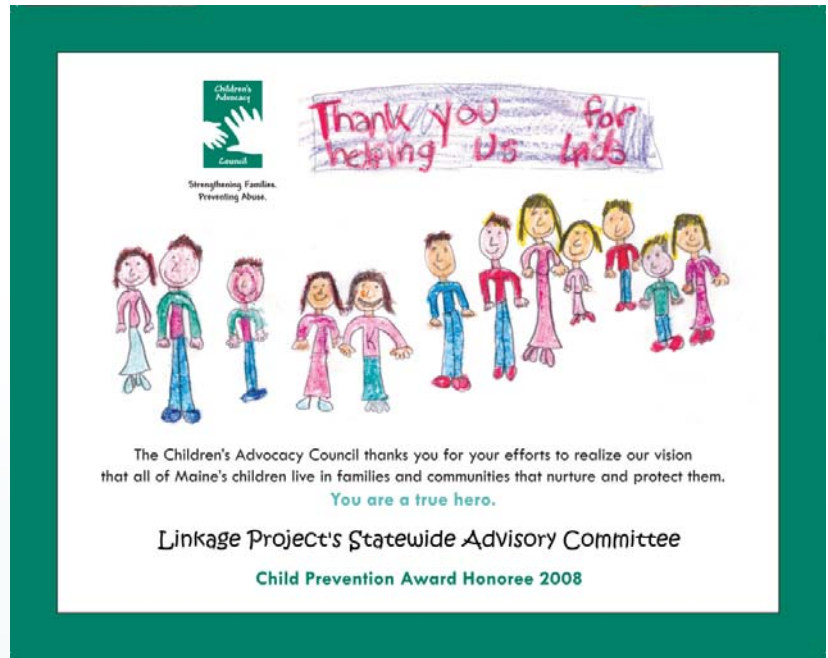
The 2008 Children's Advocacy Council Child Abuse Prevention Award