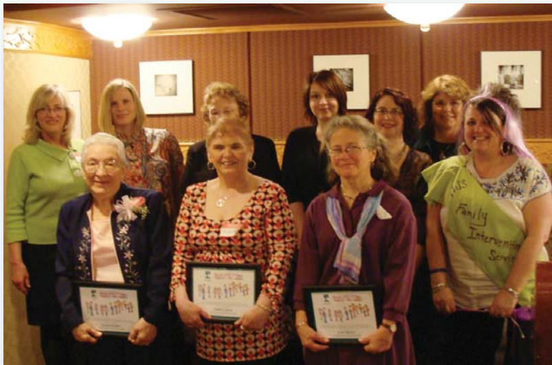
Recipients of the Children's Advocacy Council 2008 Child Abuse Prevention Award

Children's Advocacy Council Honors the Linkage Project